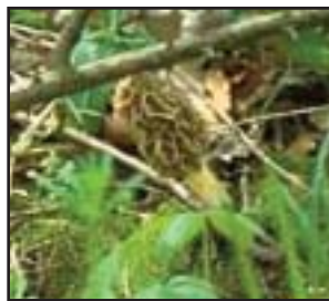
04/28/98 - 3.5” tall