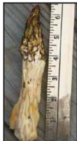
05/09/98 - 6.5” tall

I’ve witnessed morel growth many other times, but never with a camera handy. I’ve also left some morels to grow, but they did not do so. Again it depends on the weather: moisture and temperature.