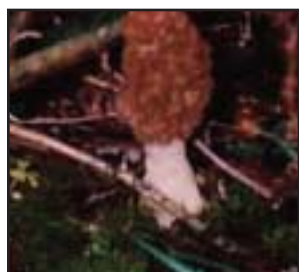
05/03/98 - 5” tall