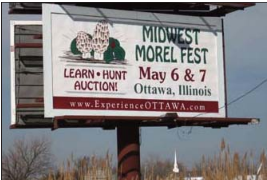
Billboard on I-55 south of the I-80 interchange near Joliet, Illinois.